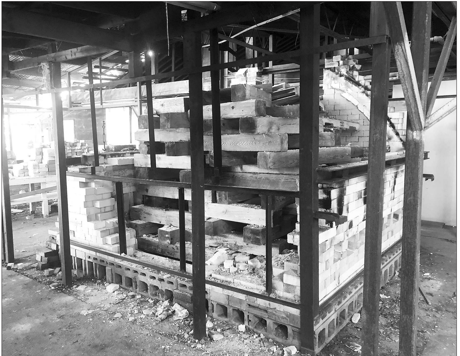
Disassembly of pottery kiln nearing completion. That is wooden cribbing used to keep the kiln roof from collapsing during disassembly.

Further work on our electric kiln as well as the building it is housed in is planned. Please contact us if you are interested in contributing as a volunteer. We plan on some weekends soon.