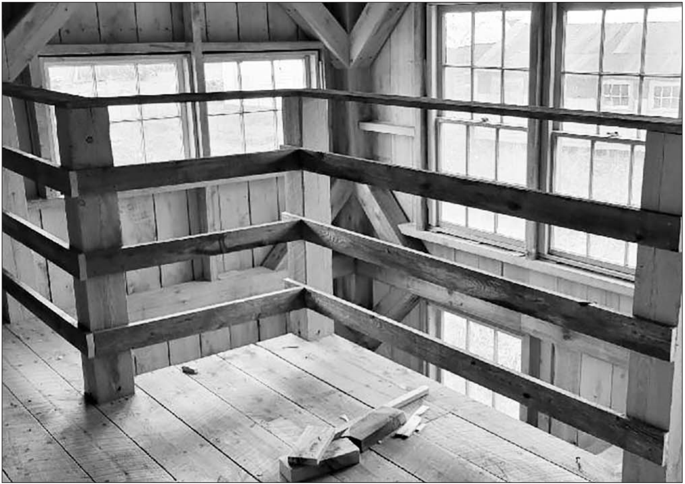
Staircase to second floor archives in the new Furniture Maker's Shop.