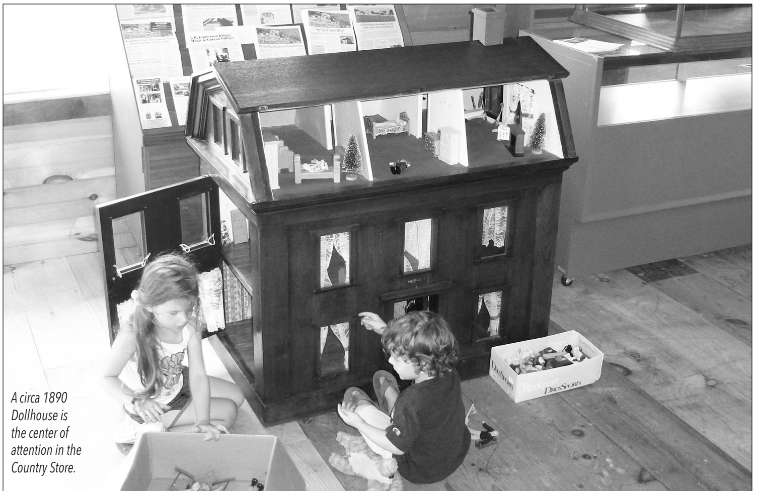
A circa 1890 Dollhouse is the center of attention in the Country Store.