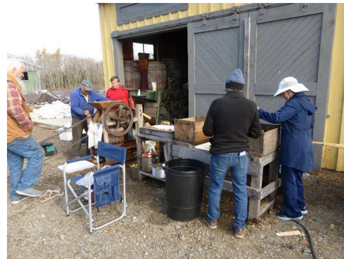
Cider Making at our Mill, November 2024