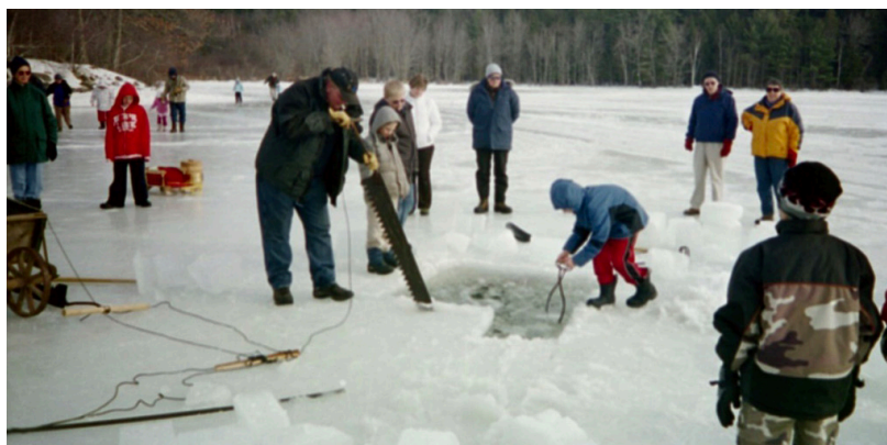
Our first Ice Harvest on Fields Pond, 2009